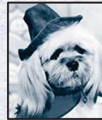
2005 · Puffy