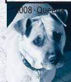
2008 · Queen