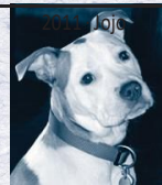
2010 · Jojo