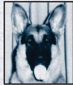
2007 · Barnaby Jones