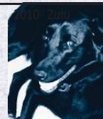
2009 · Jojo