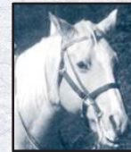
2004 · Mercedes