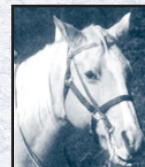
2004 · Mercedes