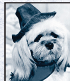
2005 · Puffy