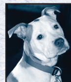
2011 · Jojo