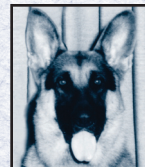
2007 · Barnaby Jones