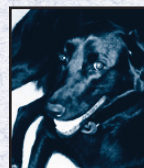
2010 · Zulu