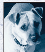
2008 · Queena